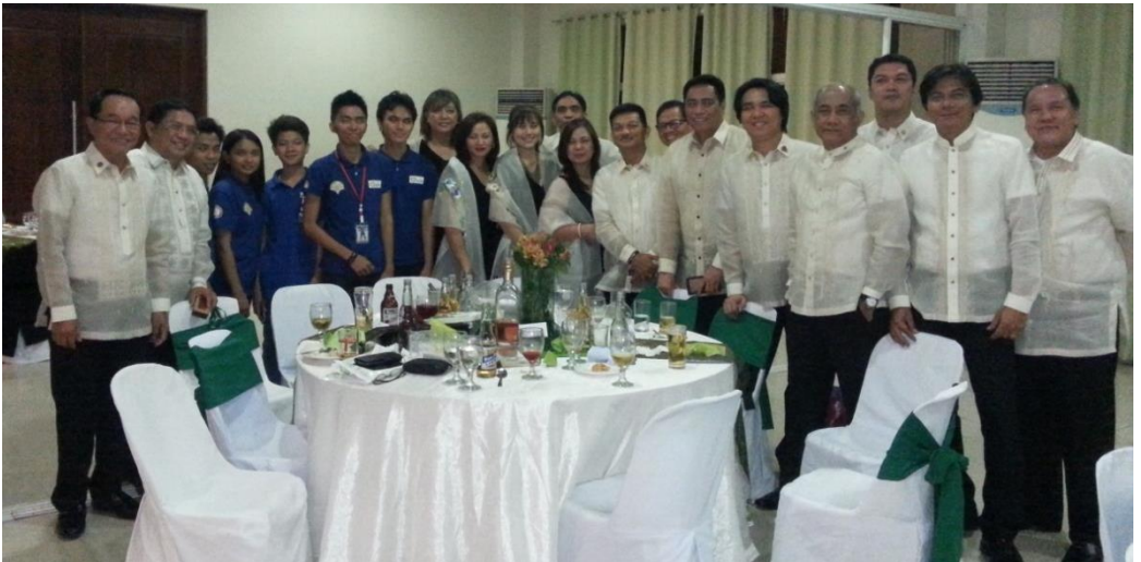
WITH THE ROTARACTORS (in blue) ACTING AS USHERS