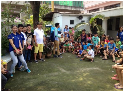
Bible-reading and Games before the feeding program