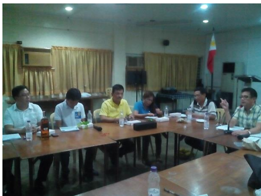
August 24, 2015 Marikina Rotary Youth Center