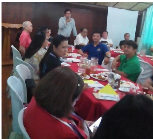
September 5, 2015 Kainan sa Bahay-Bahayan