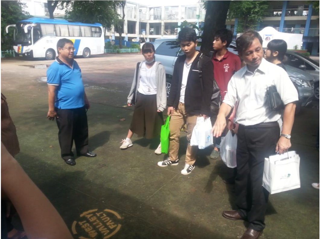
The visiting Waseda University students from Japan being shown the marker of the West Valley Fault inside the Barangka Elementary School in Marikina City

WASEND JAPANESE VISITORS – SEPTEMBER 18-19, 2015