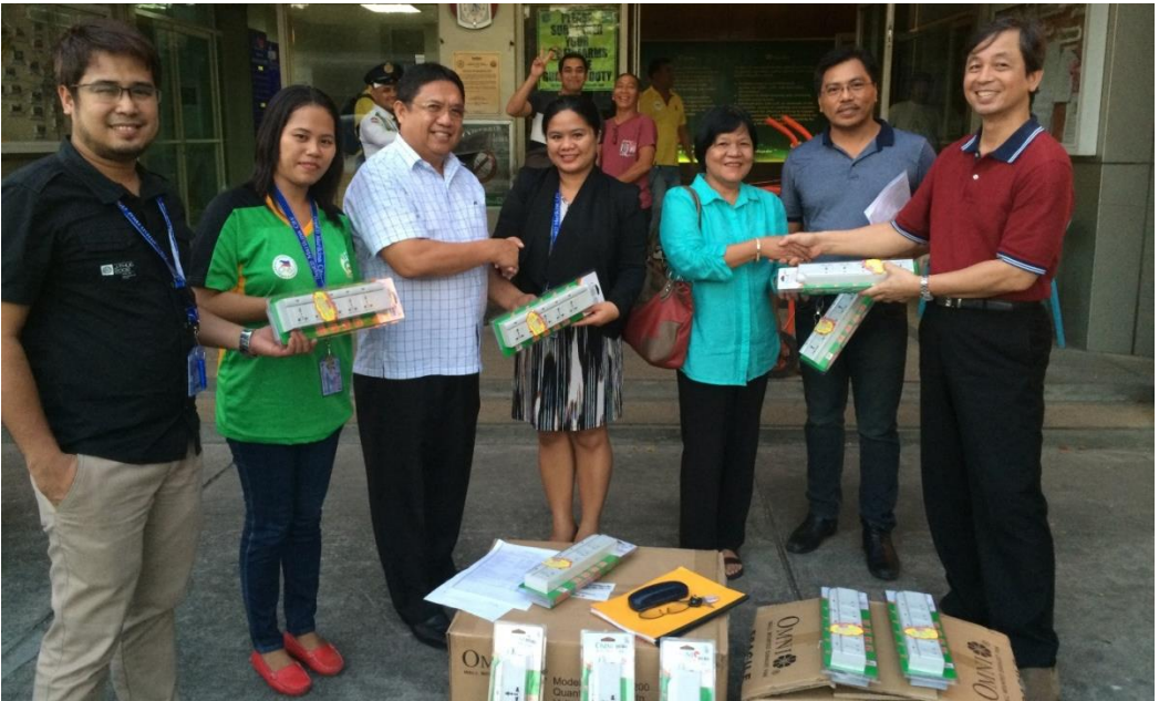
Turn-over of 42 units of 5 x 1 electrical outlets to the DepEd Marikina