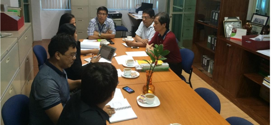
Coordination meeting with DepEd Marikina regarding the GGP1412665 Rotary e-Books Reading Centers Project